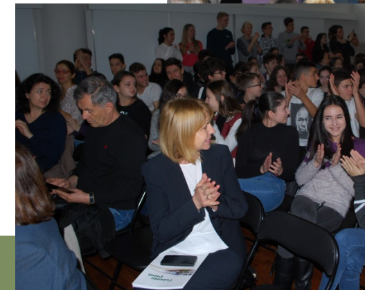
Agile Learning Forum