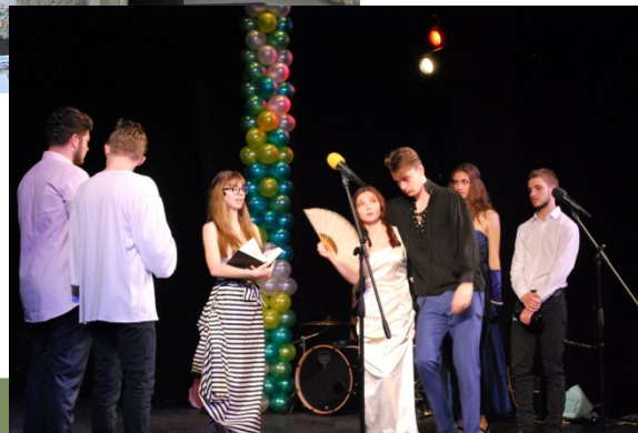
25th school anniversary celebration